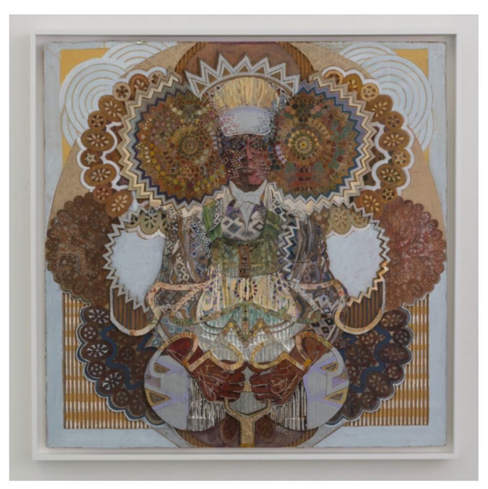
Jeff Donaldson, "Paternal Homage" (1971), mixed media, 27 x 27 inches

Donaldson wanted to replace the history of demeaning stereotypes of Black people that had been presented by white, mainstream culture. By connecting his work to Africa and developing a powerful transnational view, he aimed to develop an alternative history rooted in struggle